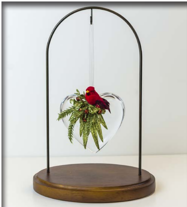
Stand not included

A Love Tree Celebration Ceremony is scheduled at 2 p.m. Tuesday, Jan. 9, in the Mercy Plaza lobby. Donors will be invited to celebrate their loved ones through prayer, a special reading of the names, presentation of name cards and ornaments, and refreshments.